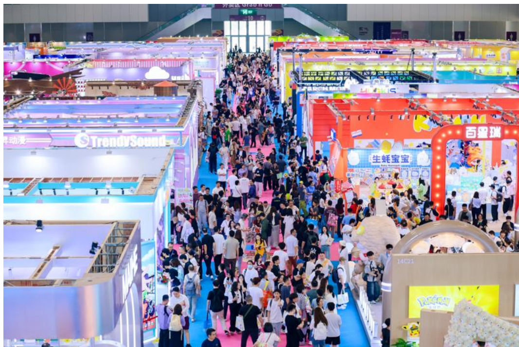
Strong engagement and positive feedback marked the 2026 edition.

Shenzhen, 7 May 2026. Drawing 77,031 visitors from 83 countries and regions, the 2026 editions of Toy & Hobby China, Baby & Stroller China, and Licensing China closed on 11 April. The fairs recorded a 35% uptick in overseas buyers – reflecting resilient demand across sectors. High visitor flow defined the debut AI & Intelligent Toys Zone and the Trendy Toys & Collectibles Zone, both showcasing the next wave of innovation. Licensing and baby exhibitors reported positive feedback, while cross-sector buyers commended the platform’s sourcing breadth and new products. The focused fringe programme and tailored business matching also sparked meaningful engagement and strengthened connections across international markets.