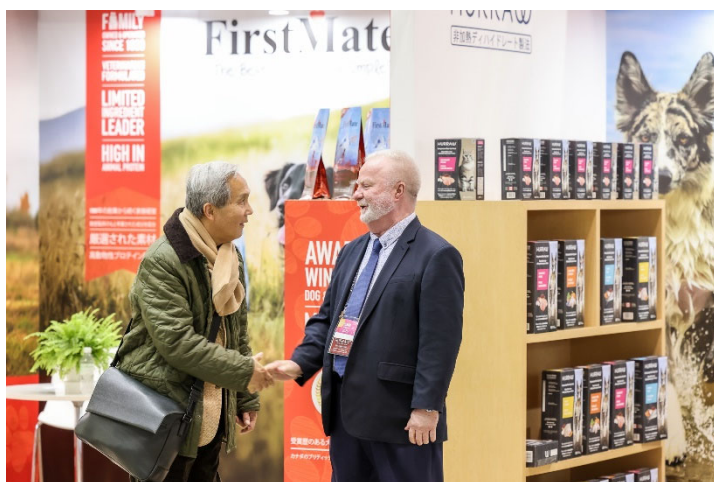
Interpets Asia Pacific 2025.

Tokyo, 23 rd March 2026. Interpets, one of Japan's premier trade platforms for the pet sector, returns under the new name Interpets Tokyo from 2 – 5 April 2026 at Tokyo Big Sight, occupying the East Halls. While large-scale renovation work at the venue will result in a smaller exhibition area compared to previous editions, the fair still expects to welcome more than 600 exhibitors from 13 countries and regions, including companies from Canada, China, and South Korea, alongside several prominent domestic brands. The show presents the latest products and services across pet food, supplies, healthcare, home goods and consumer electronics, reflecting the industry's diversification and growth. Participation from companies outside the traditional pet sector continues to expand, with organisations such as Amazon Japan G.K., SUBARU CORPORATION, and Rakuten Group, Inc. joining the showcase. Over the four-day period, approximately 60,000 visitors are expected to attend.