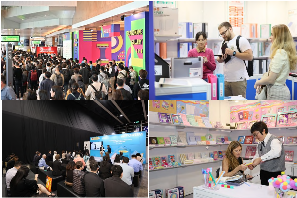
The 22 nd Hong Kong International Stationery & School Supplies Fair.

Hong Kong, 3 September 2024. The Hong Kong International Stationery & School Supplies Fair will be staged at the Hong Kong Convention and Exhibition Centre from 6 – 9 January 2025 alongside the online ‘Click2Match’ business matching platform (30 December 2024 – 16 January 2025). Entering its 23rd edition, the trade fair is expected to showcase a comprehensive range of stationery products, providing an ideal one-stop sourcing platform for buyers.