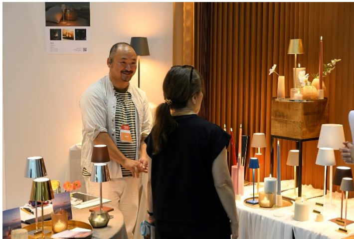
Interior Lifestyle Tokyo 2025.

Tokyo, 28th April 2026. Interior Lifestyle Tokyo will take place at Tokyo Big Sight from 10 – 12 June 2026, with its status as a leading lifestyle inspiration hub solidified by the debut of the LIVING and WORK & STAY zones and Ambiente Trends 26+. Bringing together 400 exhibitors from 15 countries and regions, the fair will showcase a diverse range of products, including furniture, gifts, home accessories, tableware and more.