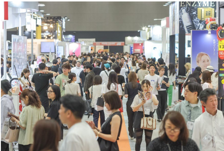
13,039 trade visitors attended Beautyworld Japan Nagoya 2025.

Nagoya, 23 January 2026. Beautyworld Japan Nagoya, a comprehensive beauty trade fair in the Chubu region, will take place from 23 – 25 March 2026 at Port Messe Nagoya, Exhibition Hall 1. Covering the full beauty spectrum, the show brings together key sub-sectors including aesthetics, hair, nails, eyelashes, inner beauty, beauty equipment, medical beauty, OEM services and business support. The 2026 edition is expected to welcome around 200 exhibitors, showcasing products and services that support the development of the industry in central Japan and beyond. With a strong track record of connecting buyers with relevant exhibitors in person through high-quality business meetings, the fair enjoys broad support from beauty professionals across Japan, particularly within the Chubu region.