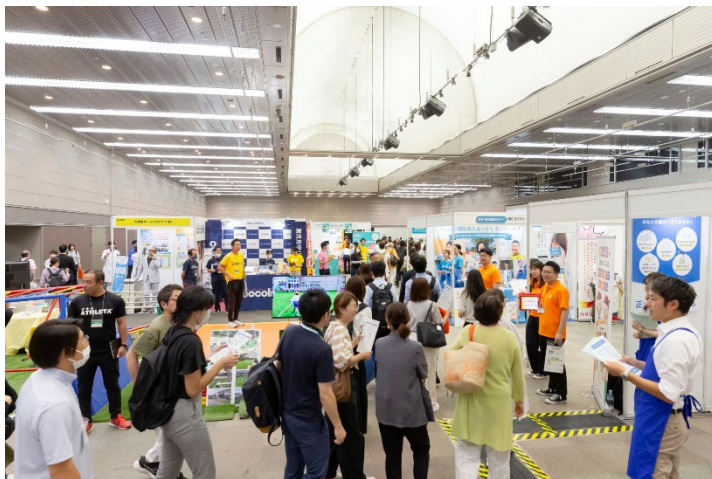
Child Edu & Care Japan West 2024 welcomed its strongest visitor flow to date.

Osaka, 6 August 2024. Western Japan's only major nursery and education fair concluded on 18 July with significant rises in exhibitor and visitor attendance (23% and 21% respectively), after two days of business and service exchange at Mydome Osaka. It provided a dedicated platform for 97 companies and organisations, and hosted 1,987 visiting childcare professionals, nursery managers, and industry stakeholders. Celebrating its fourth edition this year, the show introduced new zones focusing on information and communications technology and nutrition education, both of which garnered significant attention from buyers. To address the labour shortages within the childcare industry, the fair's Recruitment Area facilitated the matching of staffing agencies, nursery management, and job seekers. Overall, Child Edu & Care Japan West 2024 provided a diverse, regionally focused platform to meet the unique needs of Western Japan's childcare sector.