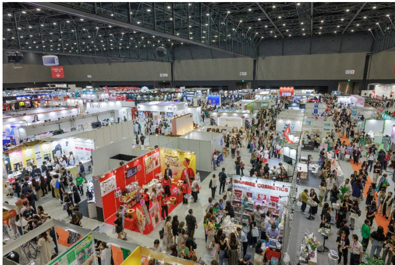
Beautyworld Japan Nagoya 2024.

Nagoya, 9 August 2024. The second edition of the Japan's largest trade fair for the Tokai region, the country's fourth most populated prefecture, welcomed 14,313 trade visitors from beauty-related industries such as cosmetics, aesthetics, hair, nails, eyelash and health care. The three-day event at Portmesse Nagoya, Hall 1 from 29 – 31 July 2024 drew 247 exhibitors, including participants from Sweden and South Korea. With the expanded size of the exhibition area, the fair introduced three new zones, namely 'Fem more', 'Wellness & Beauty' and 'Tasty'. In the special area 'NEXT', 28 first-time companies seeking to expand their business in the region enthusiastically showcased their brands. The show provided exclusive opportunities for both exhibitors and trade visitors to build long-term business partnerships and find new products and services representing the entire beauty industry in Japan.