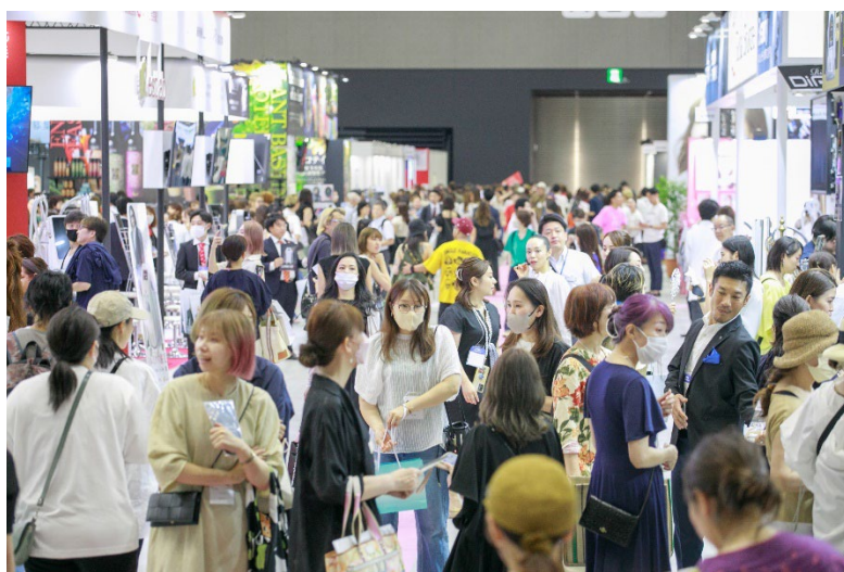
Beautyworld Japan Nagoya 2023.

Nagoya, 19 June 2024. From 29 – 31 July 2024, the Nagoya edition of Japan's largest B2B beauty and wellness trade show will open its doors to distributors, buyers and beauty professionals from Tokai and beyond. With last year's successful debut attracting 222 exhibitors and 15,586 visitors, the second edition will welcome 230 exhibitors and add three new zones. 'NEXT', a new dedicated area for start-up companies, will showcase around 30 brands. Covering everything from women's health to cosmetics and even beauty-enhancing food, the fair will provide valuable opportunities to reconnect, establish new business relationships, and explore numerous products, services and innovations.